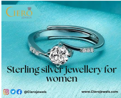
Sterling silver jewellery for women

Online traditional jewellery has become rather famous in recent times, with the advent of numerous retail websites and e-commerce sites. Indian traditional jewellery is perhaps as old as Indian history. It is as old as the Vedic ages. Earlier people used to wear chunky traditional gold and silver jewellery. With the influence of western culture when fashion is concerned, people are preferring more minimalistic forms of jewellery. Accessorizing every part of the body is the latest fad and consumers are flocking to these online retail ventures to purchase jewellery.